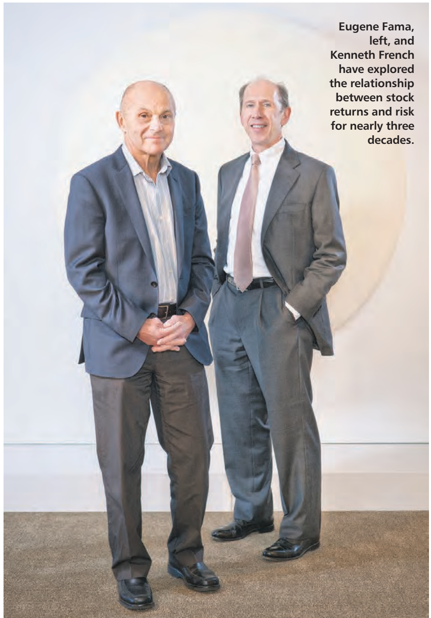
Eugene Fama, left, and Kenneth French have explored the relationship between stock returns and risk for nearly three decades.

The basics of market efficiency are often misunderstood. Some say that if factors such as a stock's value, size, trading momentum, and profitability—all of which are part of your multifactor model—indicate outperformance, then the market isn't really efficient.